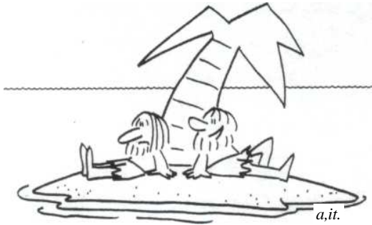
"Look on the bright side—our investments with Bernie Madoff must really be paying off by now!"

• Florida governor Rick Scott has launched an effort to identify and remove ineligible voters from the state's voter rolls. But Janet Napolitano's Homeland Security Department has refused to provide Florida access to federal databases that would aid its efforts—ignoring nine months of petitions—and Eric Holder's Justice Department has ordered the initiative halted, contending that it violates federal law, which prohibits voter-roll maintenance within 90 days of an election (Florida's primary is August 14), and discriminates against Hispanic voters. The Florida department of state's initial search, conducted in 2011, indicated that more than 180,000 registered voters may not be U.S. citizens. Since April, Florida officials have flagged 2,700 voters for removal. In addition to accusations of racism (58 percent of the flagged voters are Hispanic), state Democrats have toted out bathetic examples of "flaws" in the program, including the flagging of a 91-year-old World War II veteran. But those who receive letters need only supply valid proof of citizenship within 30 days—which several hundred people, including the veteran, have done. Some Floridians have even admitted to being ineligible or have requested removal from the rolls. So the program is working, though perhaps not to the advantage of the administration.